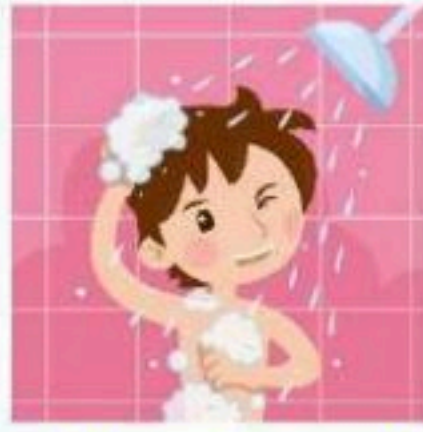
take a shower

karate – wake up – take a shower – work out – brush your teeth