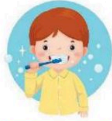
brush your teeth